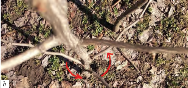
Arrangement of offshoots on Ginkgo biloba stem: a — pistillate plant, b — staminate plant