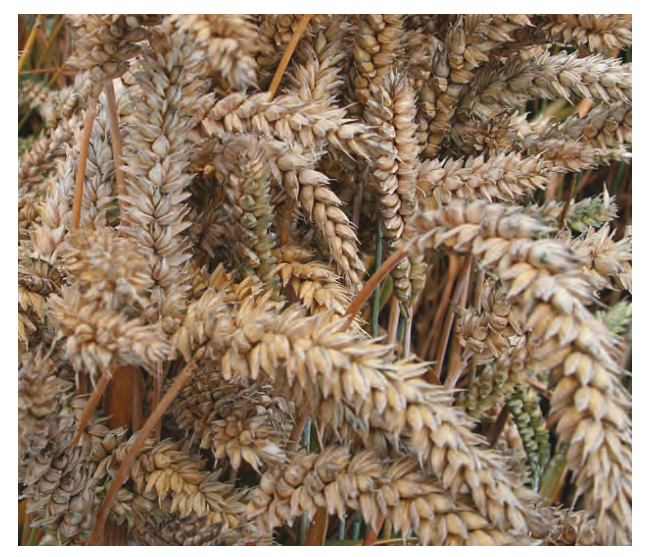
Astarta new high-yielding winter wheat variety