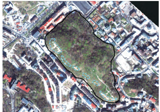
Fragment of satellite image of the Zamkova Hora with high landslide risk areas selected