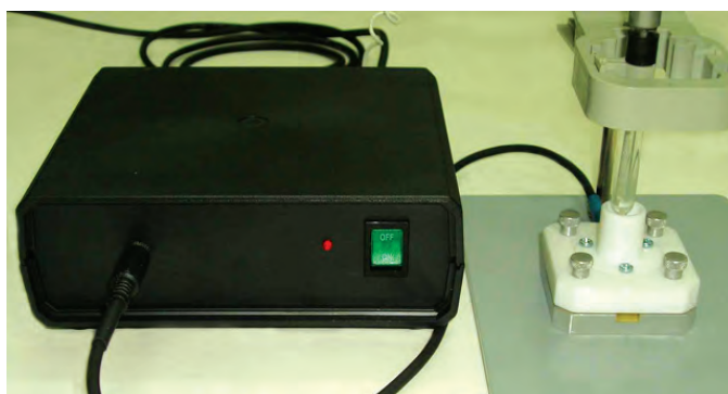
ISPT-3 Portable Biochemical Analyzer