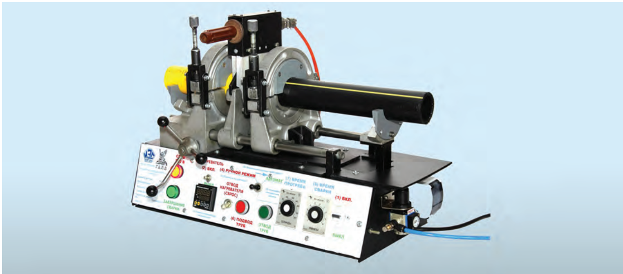
Innovative welding equipment prototype