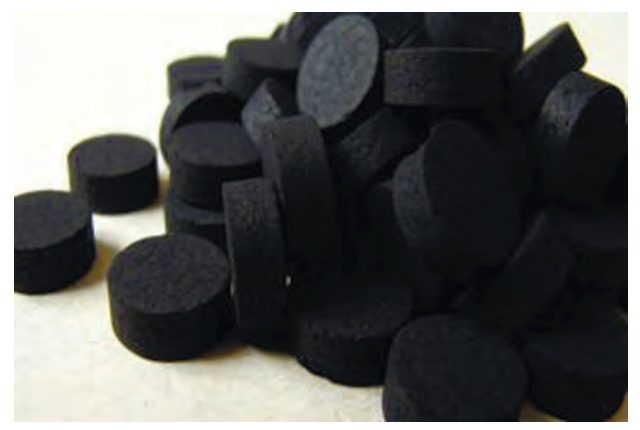
Carbon fiber nanostructured material of medical application