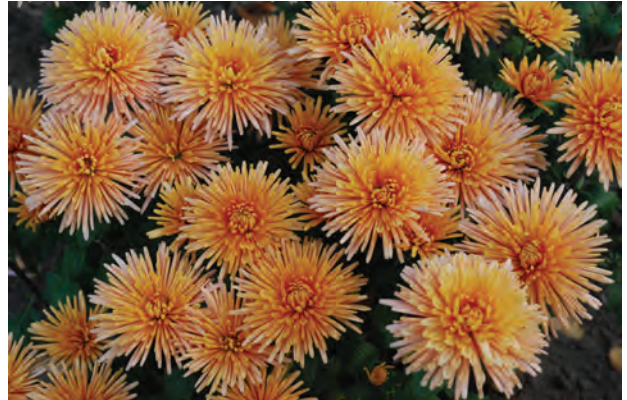
Zagadka Oseni variety