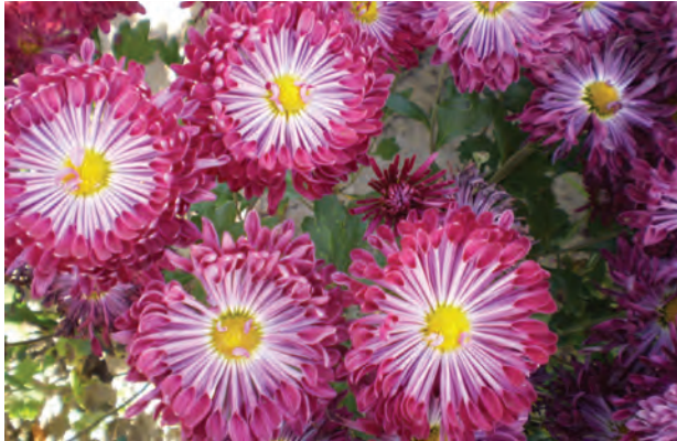
Vechirnia Simfonia variety