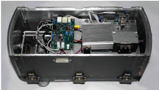
The vertical seismometer with digital laser interferometer