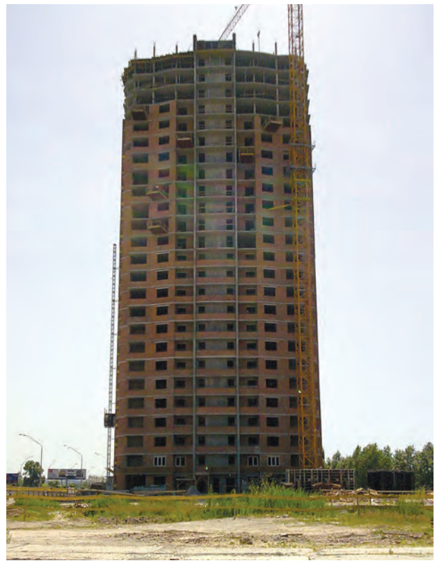
27-floor house at Obolonskiy Avenue in Kyiv with shock isolation system (situated in 100 m from shallow subway line)

The protection system enables to provide safety of buildings and structures during manmade shocks and earthquakes; to reduce the cost of construction works; to reduce consumption of materials for construction of buildings and structures; to raise safety and reliability of buildings and structures; and to widen choice of construction sites