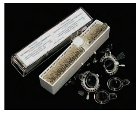
KK-42 diagnostic set