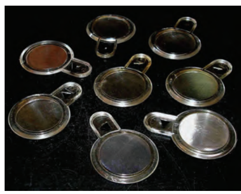
Separate microprism compensators for strabismus